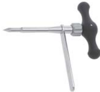
Slotted Trocar Trokar mit Hülse Trocar con vaina de sujeción

The new IMPACTOR serves for quick insertion, avoiding tire some manipulating during fixation. Reduces the danger of injuries to the surgeon in case of slipping through of nails.