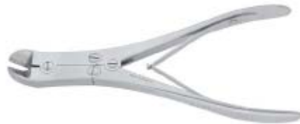
Side Cutter TC Seitenschneider TC Alicate para clavos TC