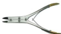
Pin Cutter TC Kneifzange TC Alicate para clavos TC