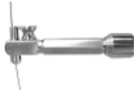
Impactor Einschläger Instrumento para clavar los clavos