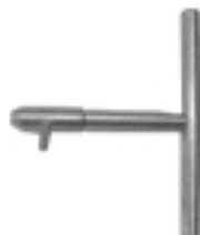
T-Handle Mini Mini T-Handstück Mango en T mini