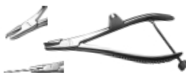
Extraction Forceps with ratchet Extraktionszange mit Sperre Pinza de extracción con cierre