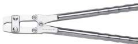
Front Cutter Kopfschneider Alicates para cortar clavos frontales

7200-0-2110 large, up to 4,7 mm 7200-0-2111 small, up to 3,2 mm