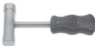
Mallet, cannulated Hammer, kannuliert Martillo canualdo